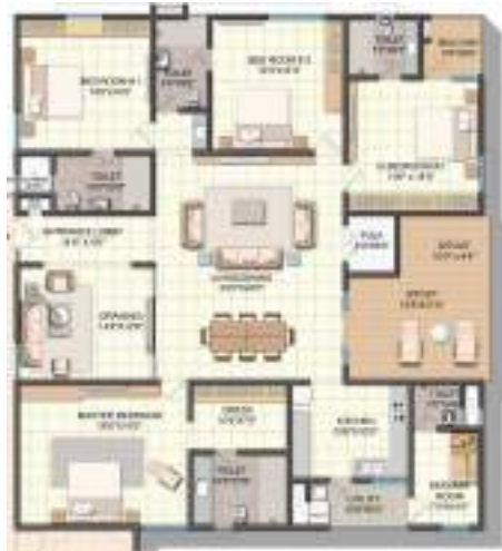
3380 Sft, 4 BHK + SQ WEST FACING