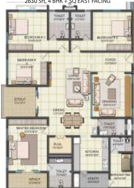
2630 Sft, 4 BHK + SQ EAST FACING