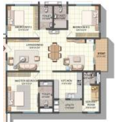
1875 Sft, 3 BHK + SQ, WEST FACING