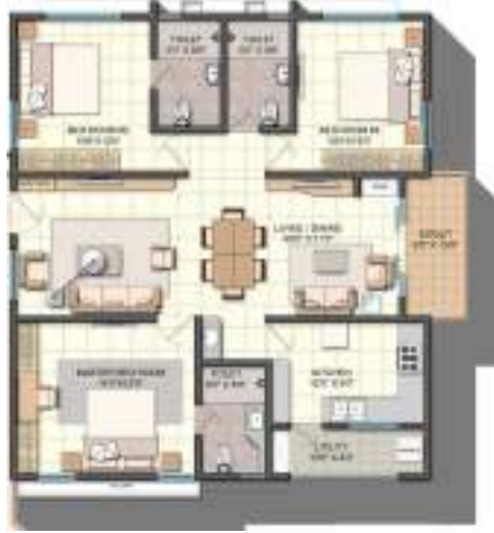
1535 Sft, 3 BHK WEST FACING