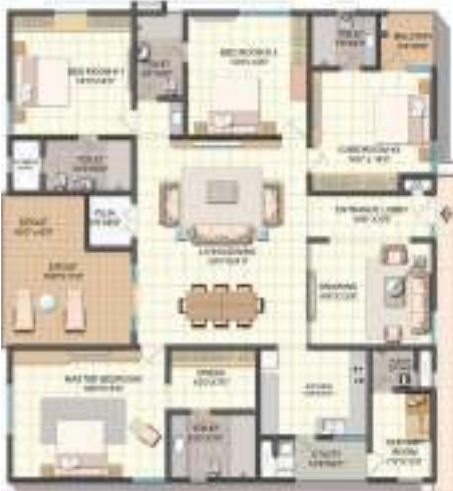
3380 Sft, 4 BHK + SQ EAST FACING