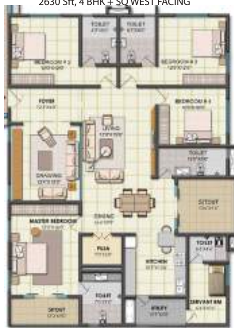
2630 Sft, 4 BHK + SQ WEST FACING