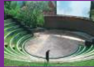
OPEN AIR THEATER