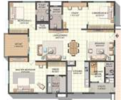
2540 Sft, 3 BHK + STUDY + SQ, EAST FACING