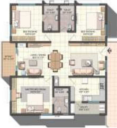
1535 Sft, 3 BHK EAST FACING